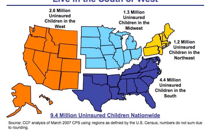
Figure 2: Most Uninsured Children Live in the South or West

reauthorization bill. States' ability to continue to make progress will depend in part on the outcome of this controversy. As these numbers demonstrate, much is at stake for the nation's children.